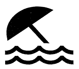
PUBLIC BATHING BEACH