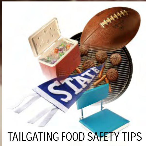
TAILGATING FOOD SAFETY TIPS